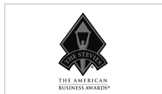
Artificial Intelligence/Machine Learning Solution - Business Technology