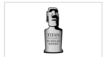
Achievement in Product Innovation