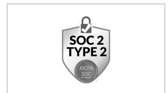
SOC 2 TYPE 2 Security Certified