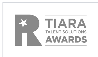
Cornerstone of On-Demand Talent Technology